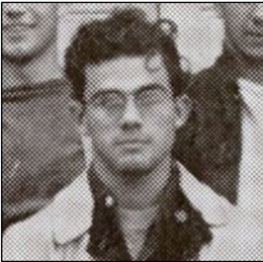
Yearbook photo from 1943 ( Wabash Yearbook , 1943)