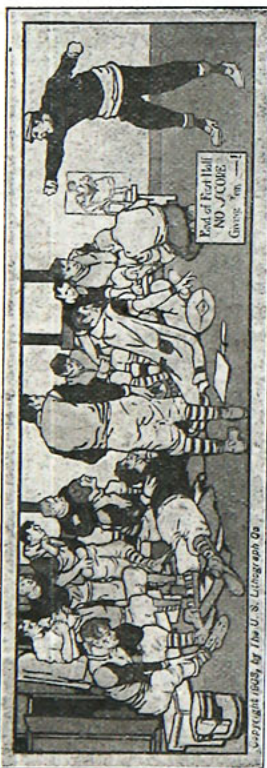
No. 10795—End of First Half. No Score. Giving 'em — 1 13 1/4 in. high x 41 in. wide. Price 60c.